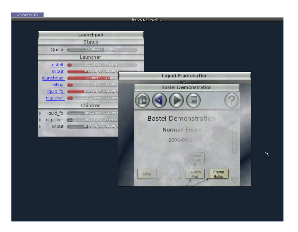
Figure 4: Executing multiple instances of the nitpicker GUI server in a nested way.

parent of scout imposes its policy of labeling the GUI session with the label "Scout". Init as the parent of launchpad again overrides this label by the name of its immediate child from which the GUI request comes from. Hence the label becomes "Launchpad \rightarrow Scout".